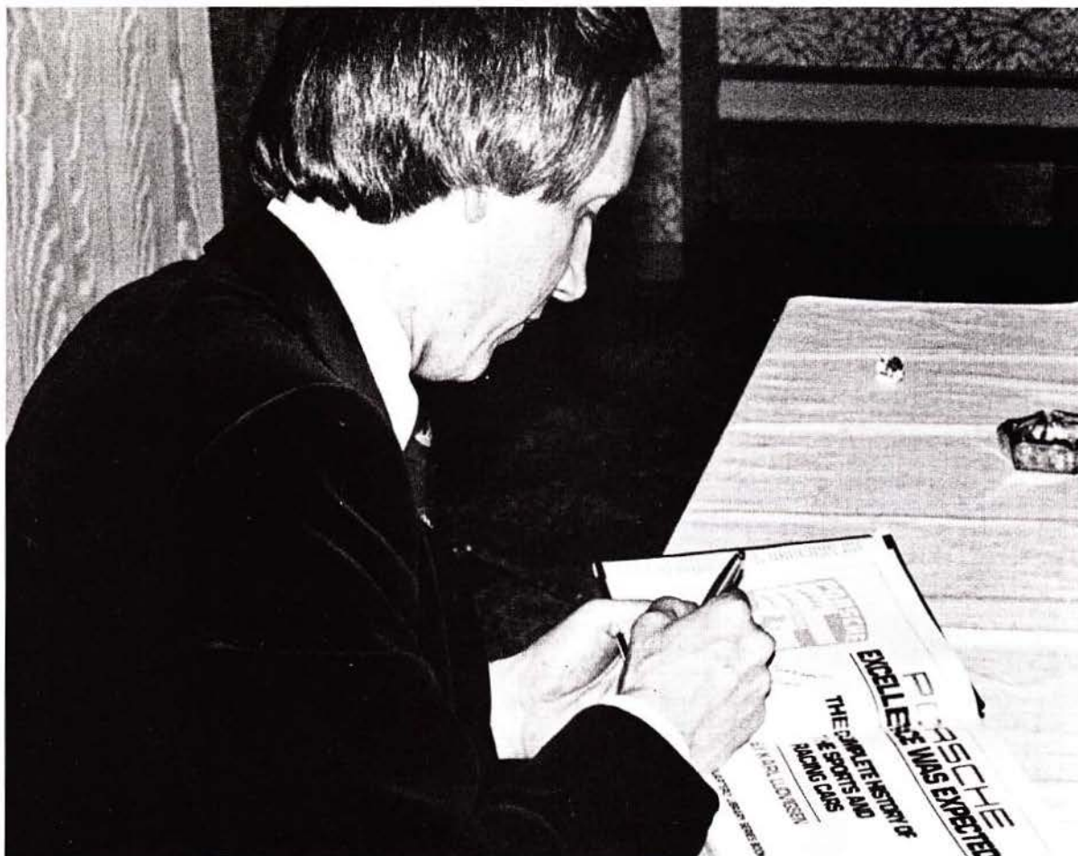
Left: The original single-volume Excellence was Expected was published way back in 1977. It was an instant hit, with copies changing hands for substantial amounts prior to the advent of the new three-volume edition in 2003